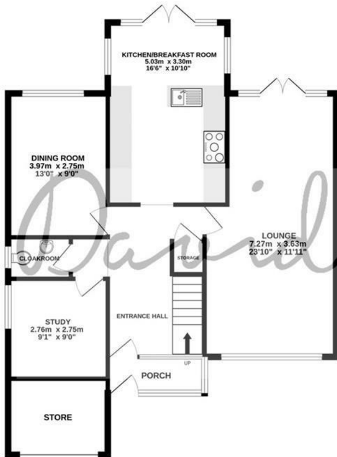
GROUND FLOOR 82.3 sq.m. (886 sq.ft.) approx.